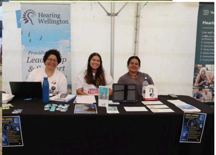
Our small team at Hearing Wellington supported a number of community events during February including Te Rā o Te Raukura (Hutt Valley) as part of the Hauora Expo and the Pasifika Family Touch Tournament. This coming weekend, they'll be promoting World Hearing Awareness Month at the Newtown Festival.